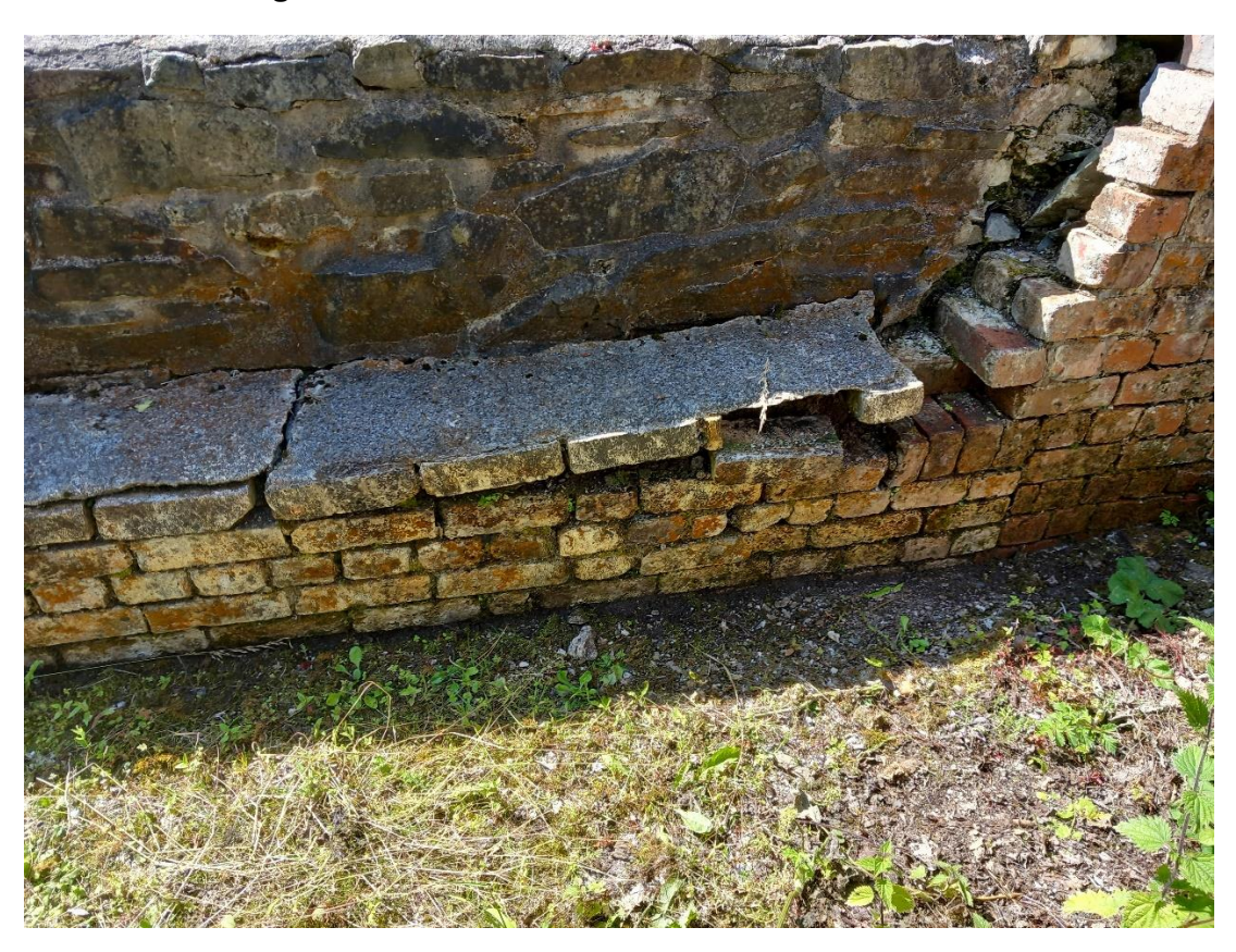
Damaged wall pre restoration