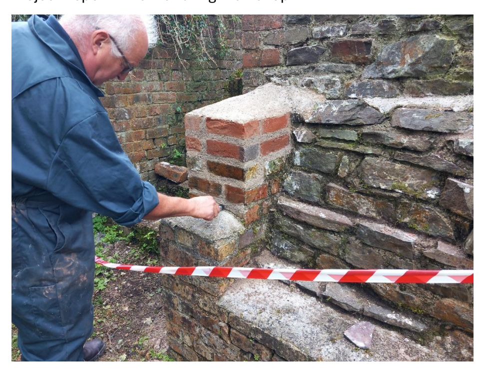
Dressing the mortar to repaired section of wall