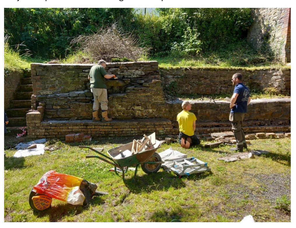
Reconstruction of lower wall and repointing upper wall