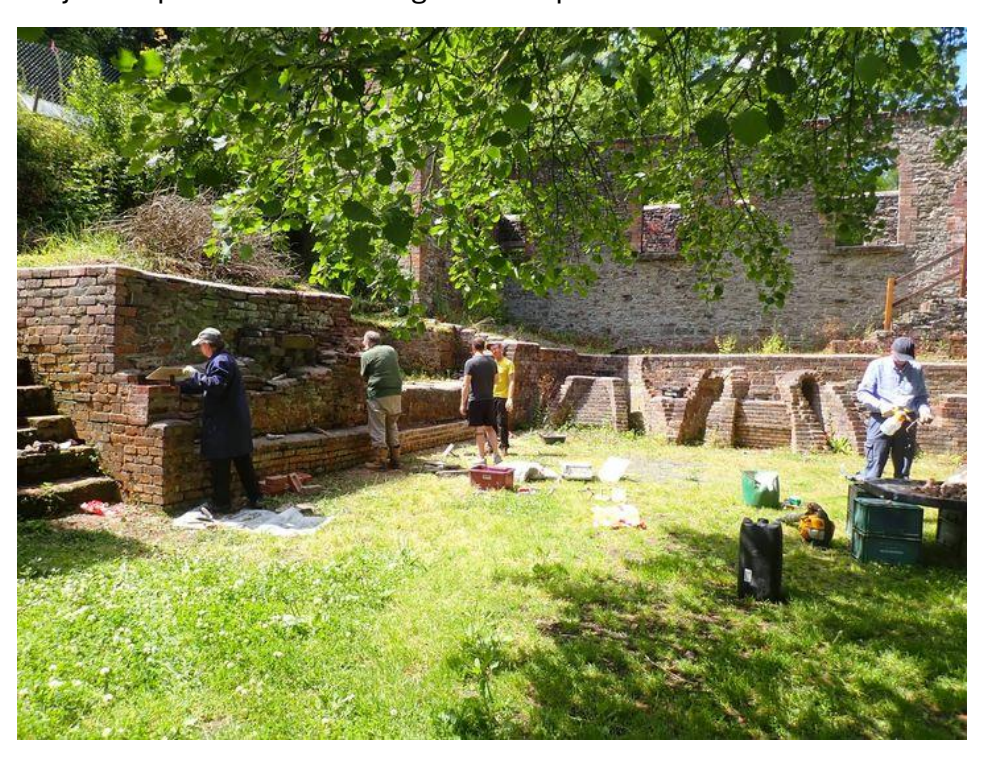
Volunteers working under guidance of trainers